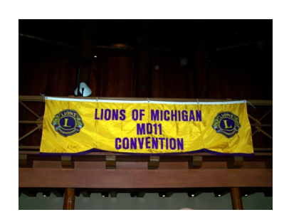
MD 11 Convention Banner