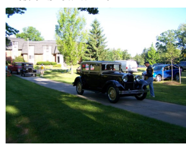
Registration Sunday morning